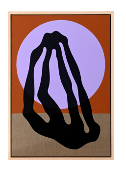
Beach '24, #1, 2023 Mixed media on natural canvas Unique Frame: 105 x 76 cm