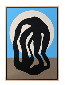
Beach '24, #2, 2023 Mixed media on natural canvas Unique Frame: 105 x 76 cm