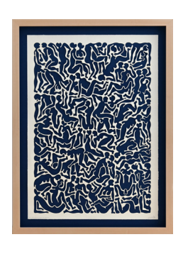
The Romans in Their Decadence, 2023 Papercut Edition of 75 plus 7AP's Frame: 69 x 51 cm