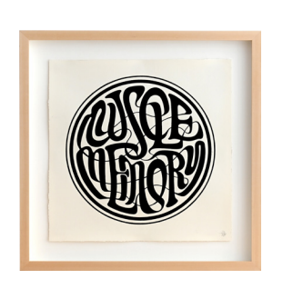
Muscle Memory (logo), 2023 Ink on Saunders Waterford Unique Frame: 55 x 55 cm