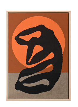
Beach '24, #3, 2023 Mixed media on natural canvas Unique Frame: 105 x 76 cm