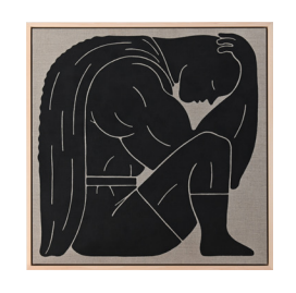
Superman, 2023 Graphite on natural canvas Unique Frame: 105 x 105 cm